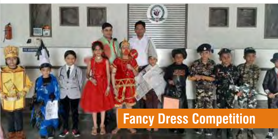
Fancy Dress Competition