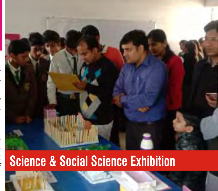
Science & Social Science Exhibition

Festivals are oxygen and life of society. Celebrating events and festivals in schools have become an integral part of learning and building a strong cultural belief in a child. Such celebration will bring students closer to traditional and cultural belief. A close bond is built between the students as they understand each other's different customs. Apart from building relationship and friendship, such celebration will bring happiness and love amongst the students. Keeping its value intact SWIS wish to offer the right kind of educational system which is based on moral ethics.