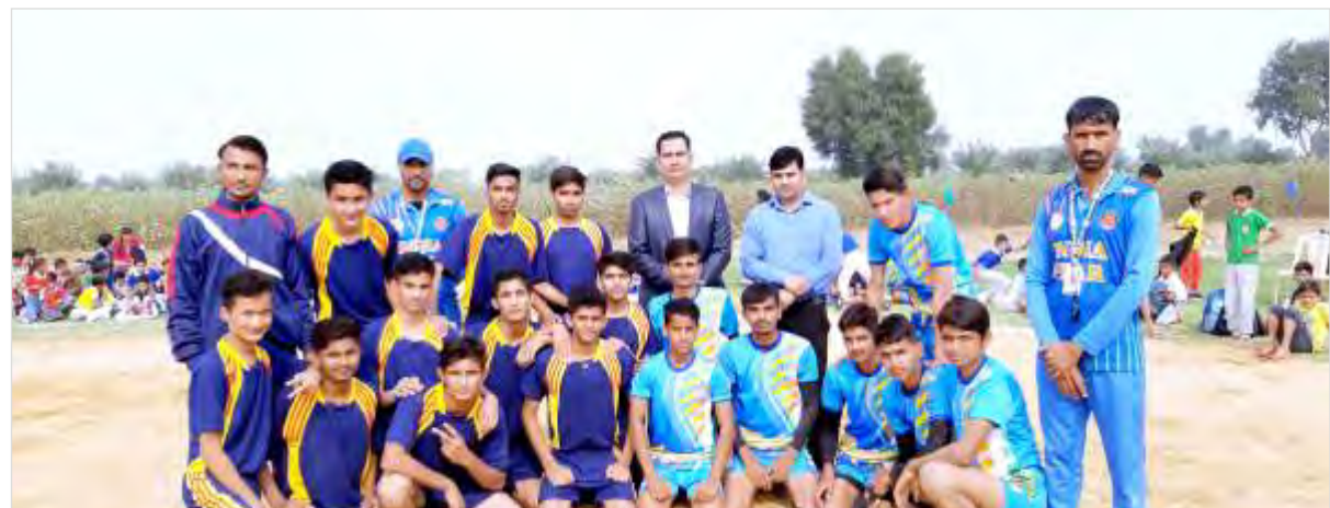
Sports & Athletics