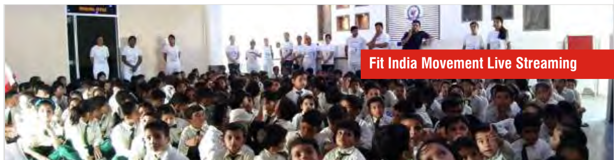
Fit India Movement Live Streaming